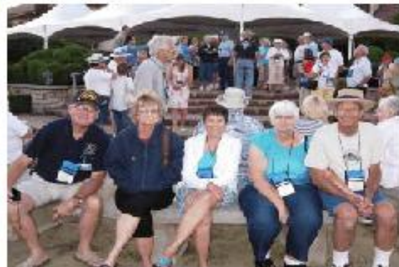
Some of our group at the King Estate Winery

The N.W Regional Meet was outstanding. The theme was Country Fair Days With The McKenzie 'A's. The theme was executed throughout the meet in many ways. Following is a partial list of all we did in the five days. We toured the King Estate Winery, we went to Carnival Days, we did seminars, we did fashion, we did raffles, we did Hubley Races, we did a Suitcase Swap meet, we drove in the Grand Tour Extraordinaire, we saw cars being judged, and we saw some excellent entertainment. Of particular interest was the Grand Tour Extraordinaire, the covered bridge tour. Approximately 750 covered bridges still remain, out of 10,000 in the 1870's. Most covered bridges still in existence are located in Pennsylvania, Ohio, Vermont Indiana, New Hampshire, and in Oregon. Oregon with 50 covered bridges has more than any other state west of the Mississippi. Of those 50 bridges, 20 are located in Lane County. We saw 4 bridges on the Grand Tour, all located within a 5-10 mile radius of Cottage Grove. Cottage grove ranks #2 in the most covered bridges near its city limits, outranked only by another small Oregon town. After the covered bridge tour, we had a BBQ in the Park, and listened to two groups, the Hanson Family Singers, and Lee Highway Bluegrass. Both excellent.