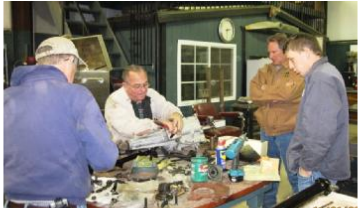
The Master showing the students.