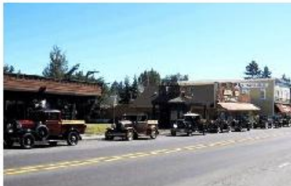
Lined up in Sisters - Pickups Rule!!