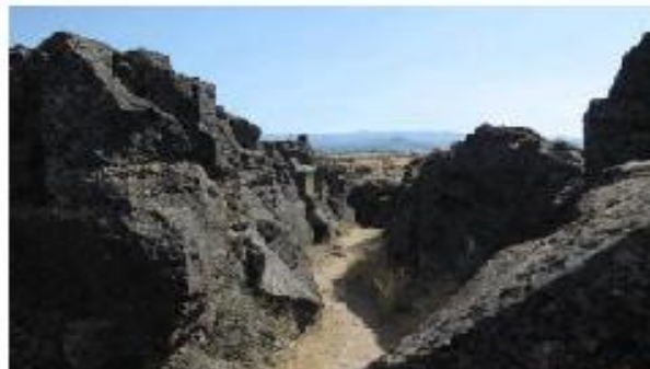
Captain Jack's Last Stronghold