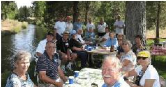
Best seminar I've ever been to!!