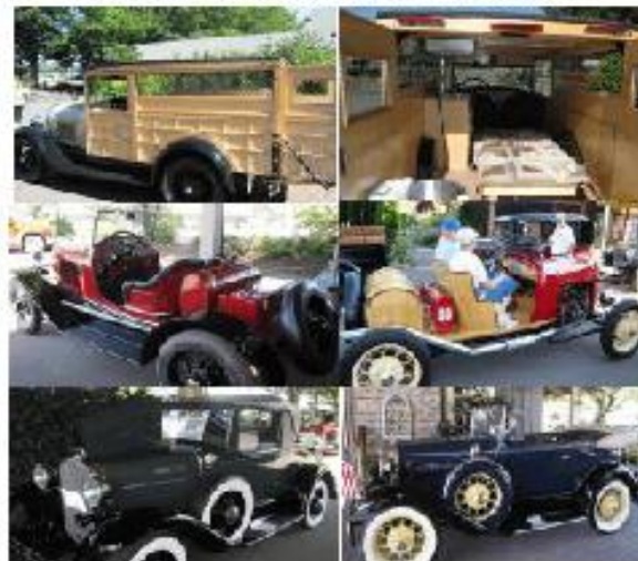
Some examples of some of what we saw - Top a Traveler, Center Speedsters - Bottom L Roadster with a Donovan Engine for $30,000 - Bottom R Beautiful 2 Door Phaeton