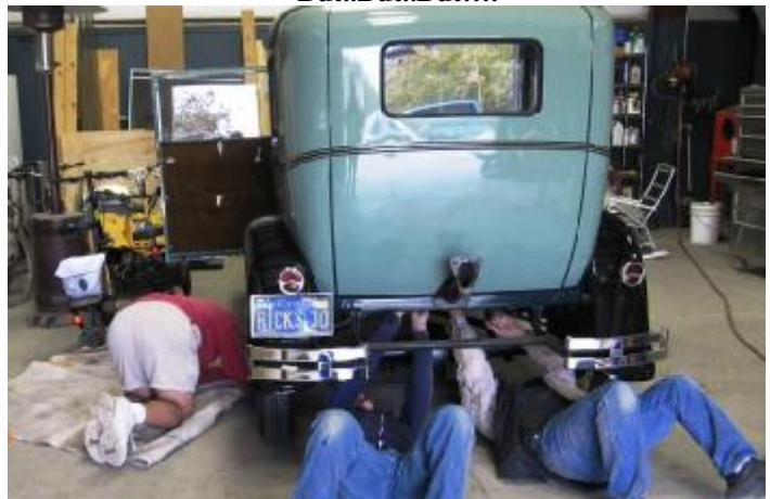
How many Mechanics does it take to????