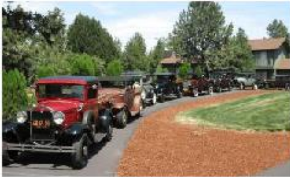
We improved the looks of Bill's driveway