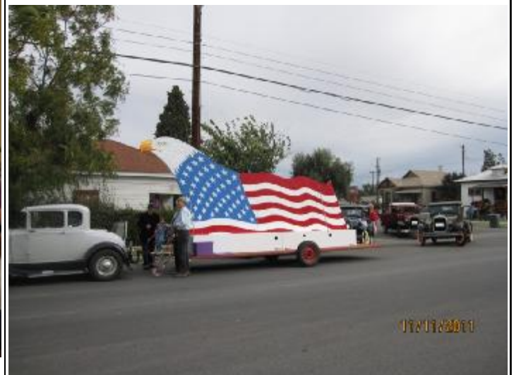
This year, the Model A Club had it's own float in the Veteran's Parade, even pulled by a Model A!