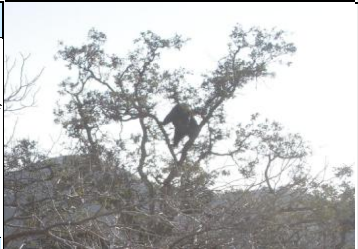
We all had a blast on our camping trip to Three Rivers, there were fourteen Model A's there, we saw a big bear in a tree.