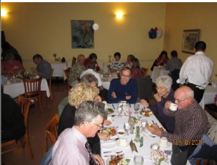
We all ate well at our monthly Drive an A to Dinner to the Bakersfield College - Gourmet Chef Training Class Restaurant